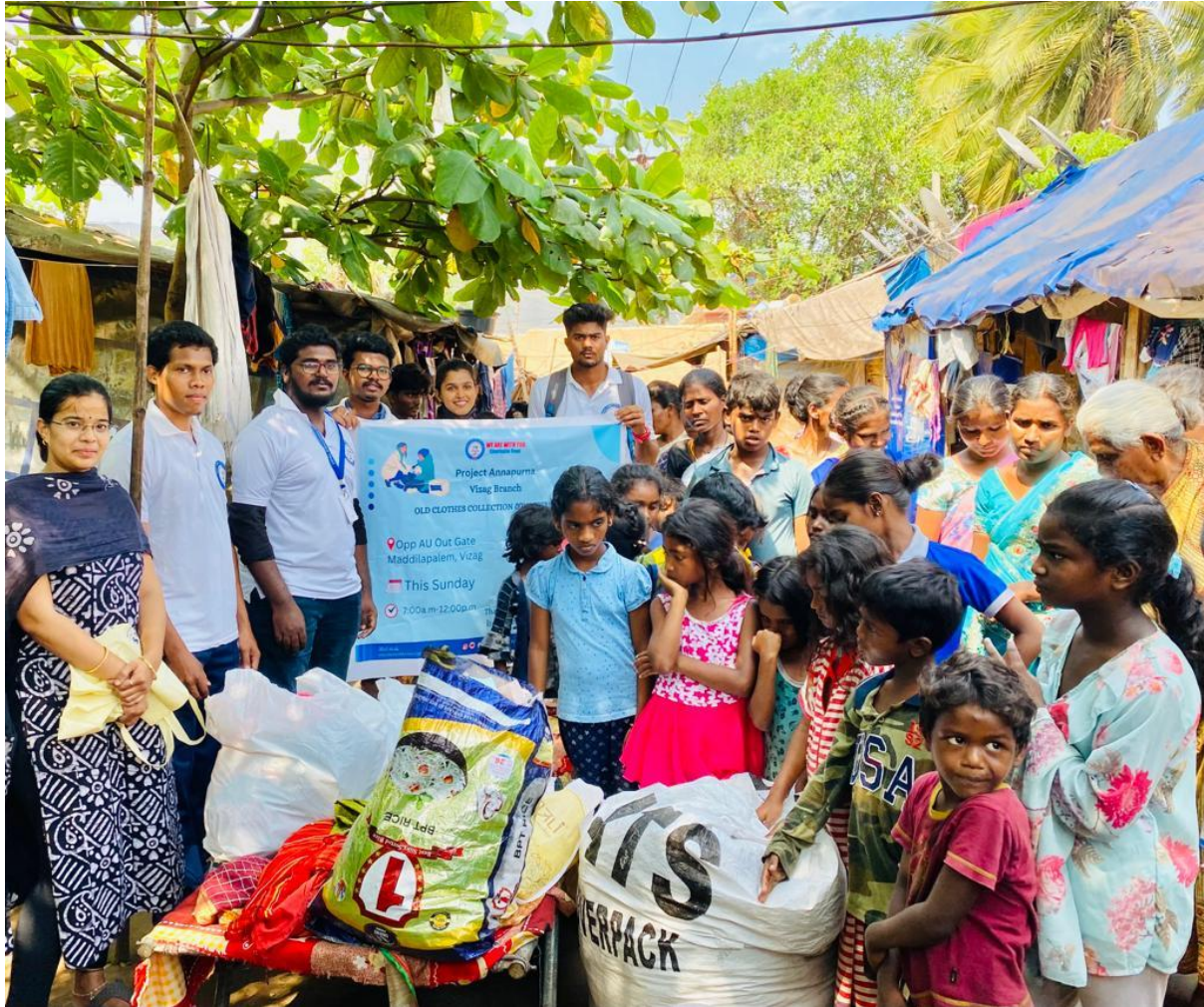
Old cloths collection and distribution

Glimpse of a volunteer program conducted by the volunteers under the concept of Project aAnnapurna, Vizag Branch.